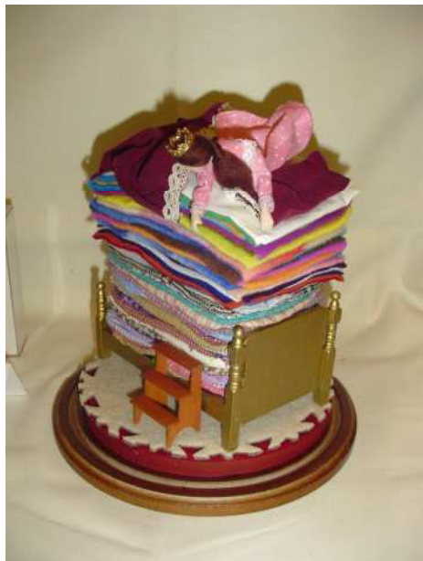
The Princess and the Pea By Jan Prescott