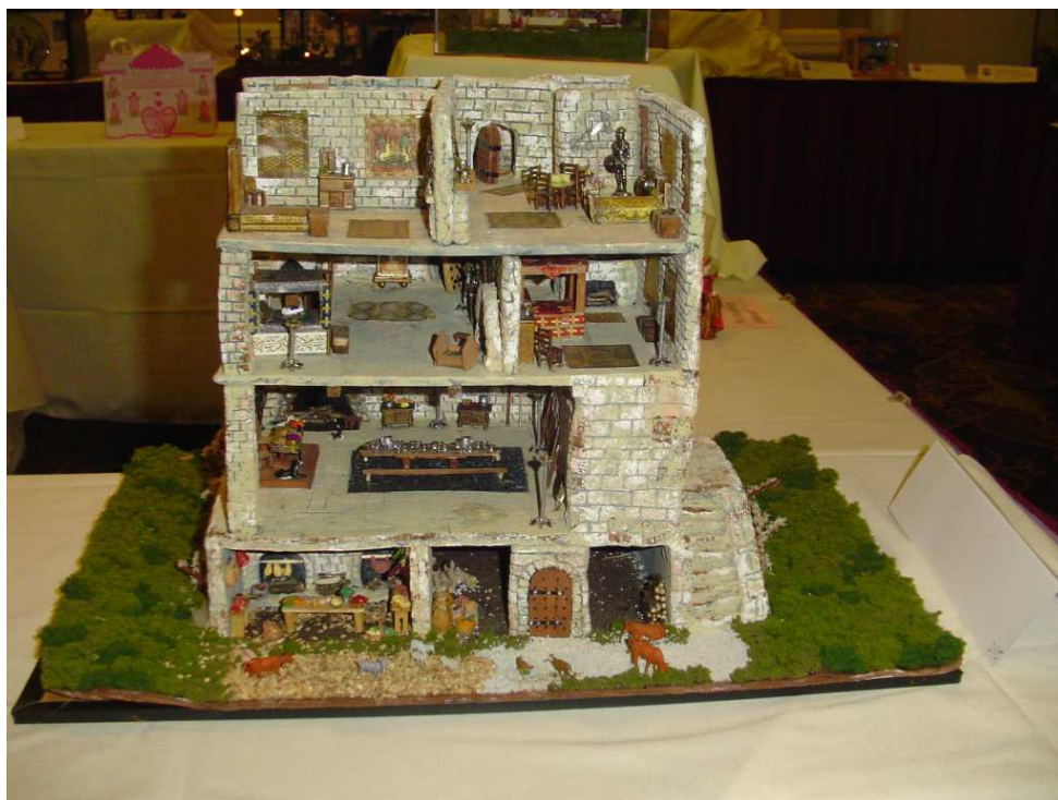
Castle Stalker by Bernadette Shustak